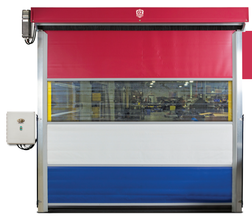
10'x10' door with red, vision, gray, and blue replaceable panels.

Our G2 high performance doors are available with the options you want and the reliability you need for your facility. Whether you are looking for a high speed door fully integrated with your building's safety systems, or simply a reliable door to separate your spaces, G2 doors minimize downtime and maximize profitability in your facility.