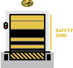
Fall Guard Safety System

While the other guys aim to check the OSHA box, they create additional risk by allowing falls over or through their "barrier." Fall Guard creates a complete safety zone covering the entire opening of your loading dock, ensuring maximum safety while minimizing risk at your facility.