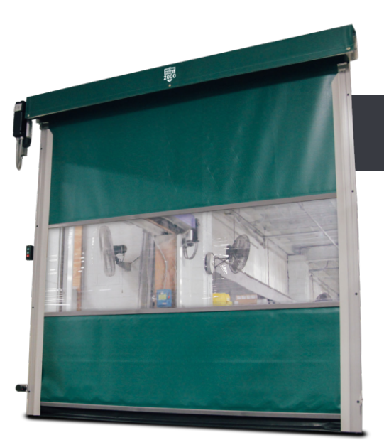
10'x10" door pictured with green & vision replaceable panels.

6'x9' door pictured with blue replaceable panels.