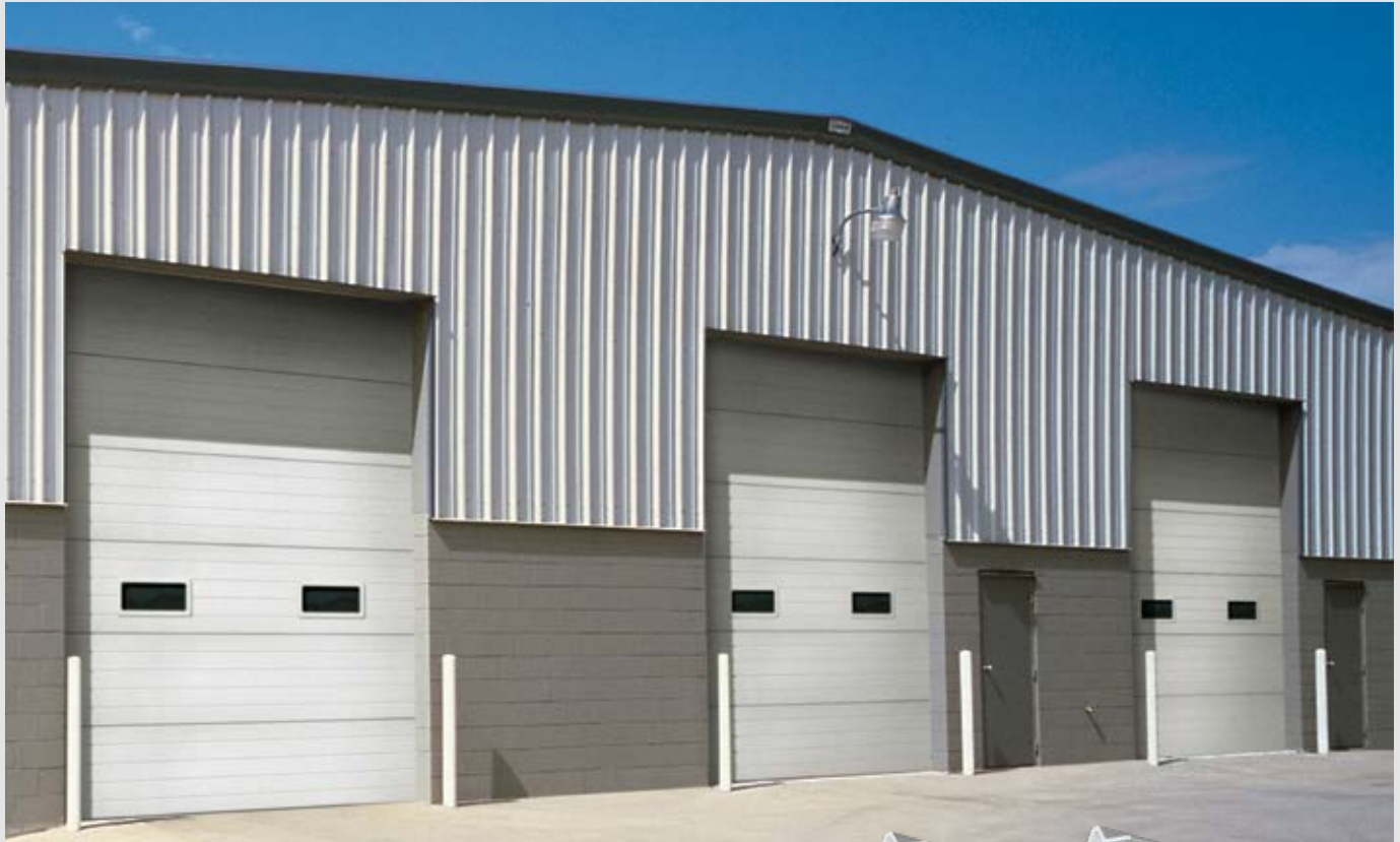
Model 520, 12'2" x 16' Doors; Shown with 24" x 6" Lites