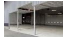
Carry-away, roll-away or swing-up mullions are available on select sizes.