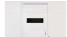
32" wide x 80" high (.81 m x 2.3 m), max 16'2" (4.9 m) wide section.