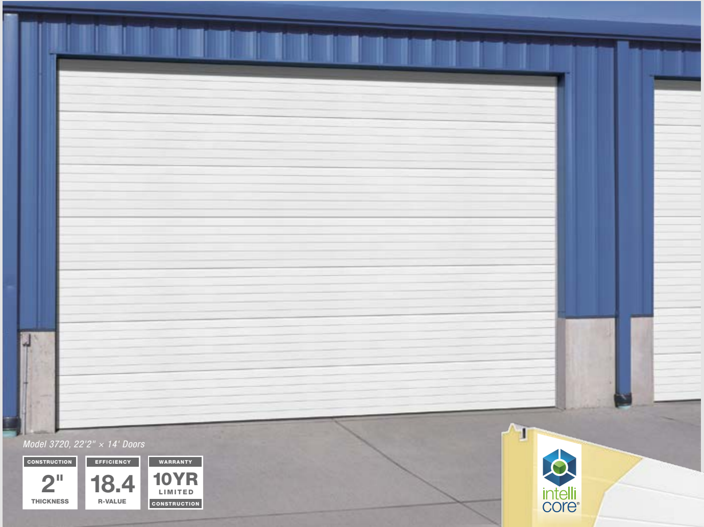
Model 3720, 22'2" x 14' Doors