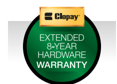
Upgrade your standard door with industrial-grade components.