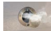
Can be cut into any type of sectional door. Available in select sizes.