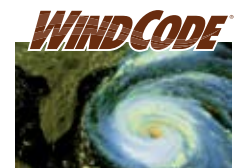
WindCODE® reinforcement available up to W1 design pressure (DP) 14 PSF, depending on size. Doors tested 50% greater than DP.