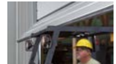
Single section and double sections available on select sizes.