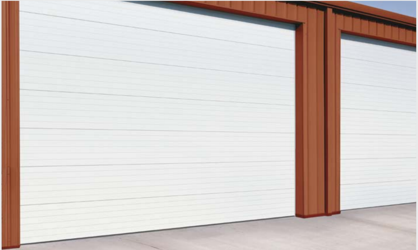
Model 3715, 14'2" x 14" Doors